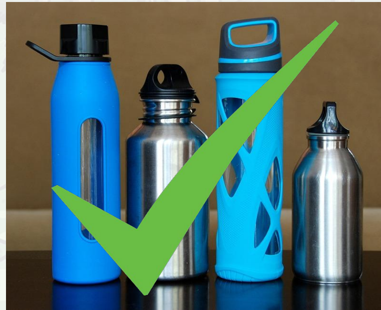
Photo courtesy of (@pixabay.com) - granted under creative commons licence – attribution

Photo courtesy of (@Wikipedia.org) - granted under creative commons licence – attribution