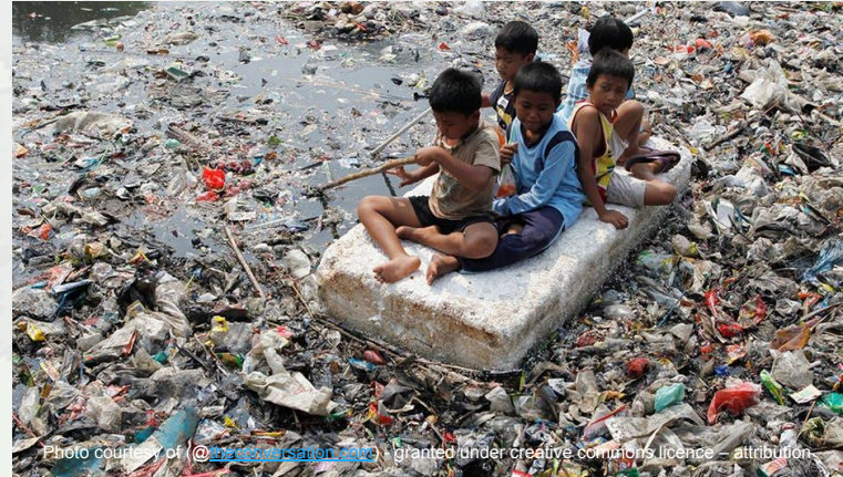
Photo courtesy of (@ twinkl.com ) - granted under creative commons licence - attribution