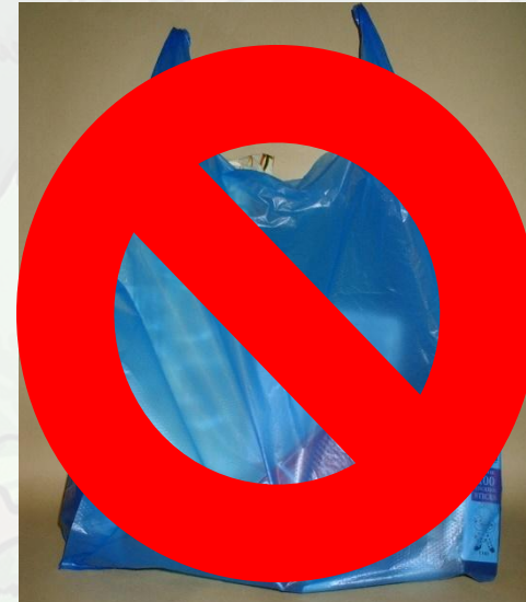
Photo courtesy of ( @flickr.com ) - granted under creative commons licence – attribution

Photo courtesy of ( @pixabay.com ) - granted under creative commons licence – attribution