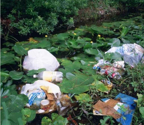
Photo courtesy of ( @Wikipedia.org ) - granted under creative commons licence – attribution