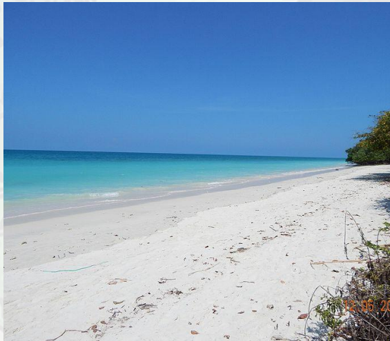
Photo courtesy of ( @commons.Wikimedia.org ) - granted under creative commons licence – attribution

You can make a difference just by making different choices.