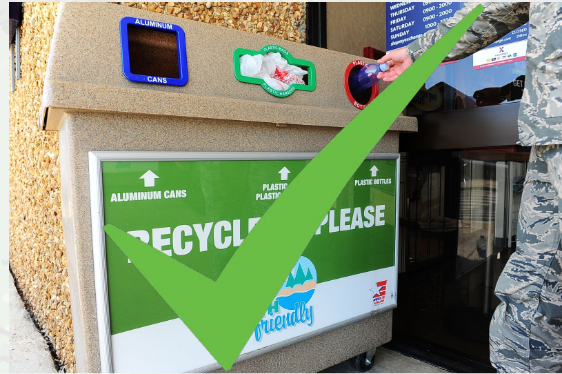
Photo courtesy of (@Columbus.af.mil) - granted under creative commons licence – attribution

Instead of throwing plastic away, recycle it in the proper places.